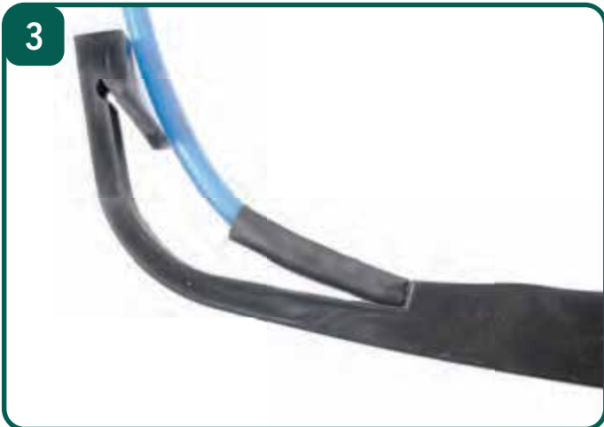
Finally, pull heat shrink tape down. The tape should be flush with the firmer. Heat as recommended by tape manufacture.