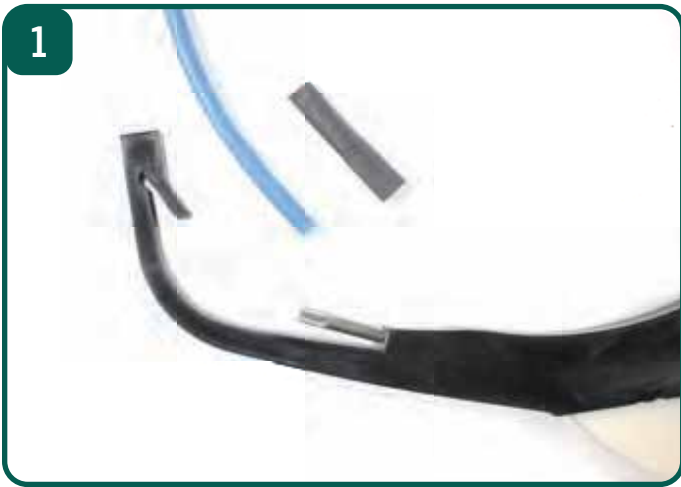
Cut end of liquid tube to make a flush end.

If you are having issues/leakage with your liquid tube connection to the firmer try the following steps.